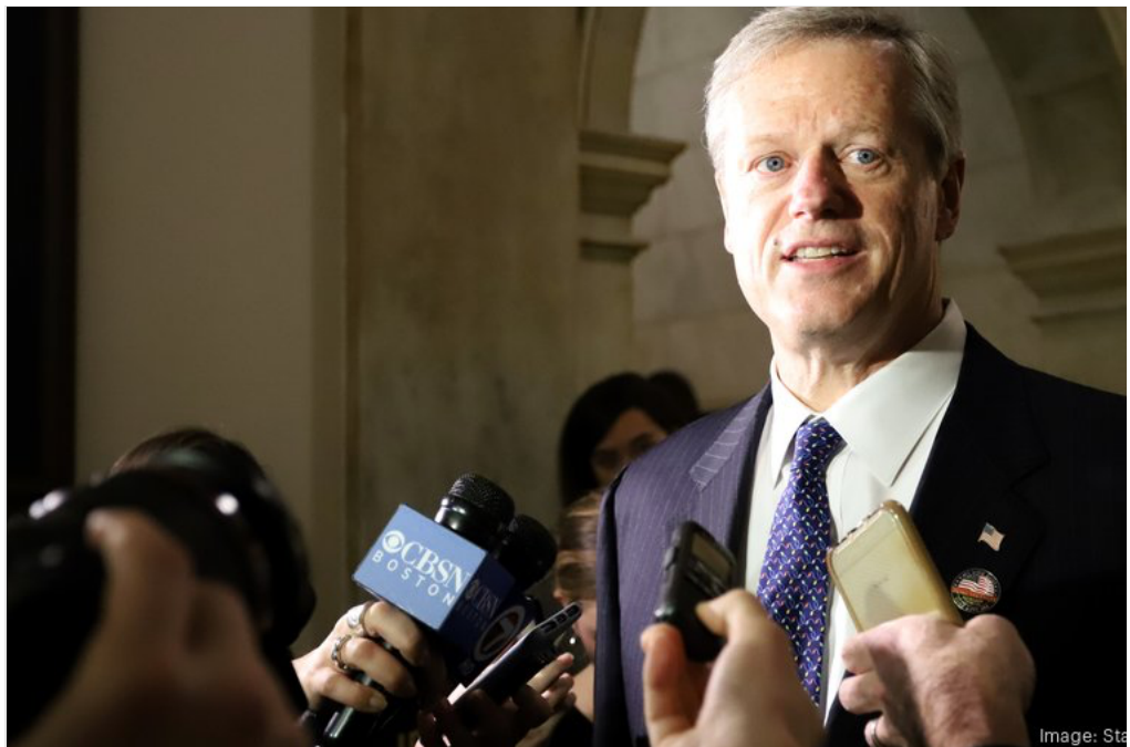
Gov. Charlie Baker